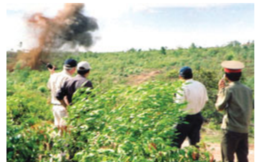
Mine clearing activities in central Quang Tri Province. Government